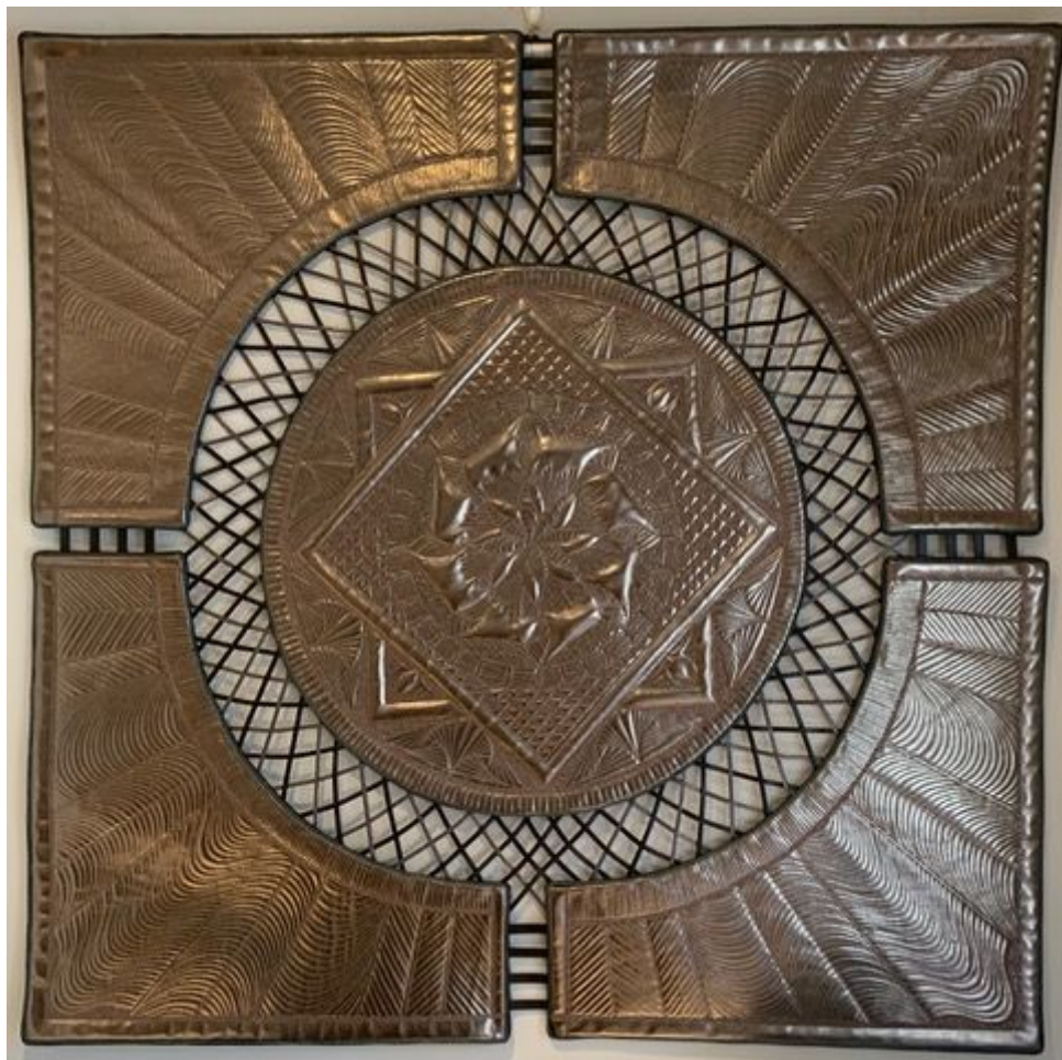
Example of Quilting on Leather by Annelize Littlefair

Maximum Number - 15 Standup, 5 Sitdown (if more than 5 Sitdown quilters would like to do hands on with leather we may run it as a separate class on Thursday morning instead. In this case you will need to choose one of the other options shown below).