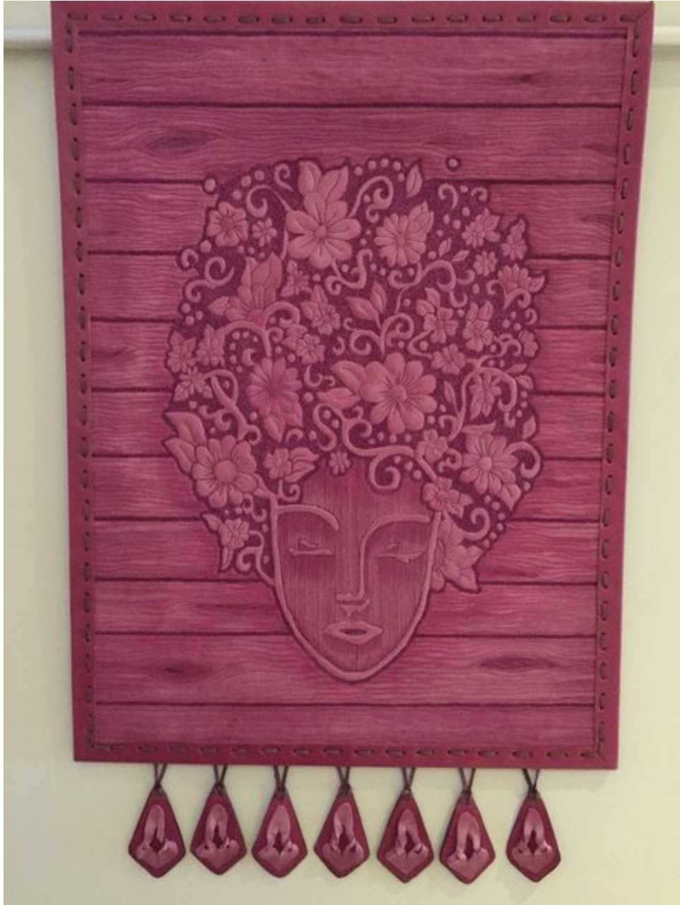
Example of Quilting and Painting on Leather by Annelize Littlefair