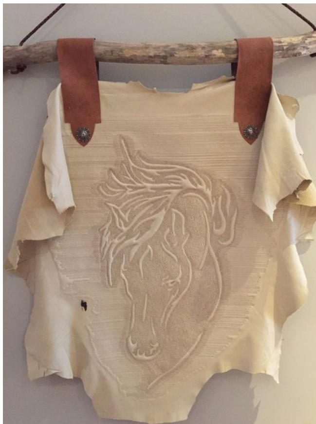
Example of quilting on leather by Annelize Littlefair

Maximum Number - 15 Sitdown (if less than 6 Sitdown we will run as a separate class on Wednesday afternoon instead).